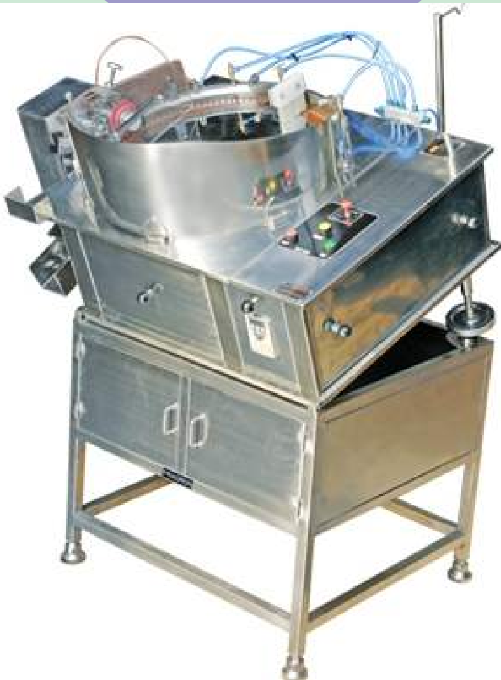
TABLET / CAPSULE PRINTING MACHINE