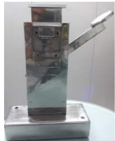
Motorised Tube Filling 50ml to 250ml