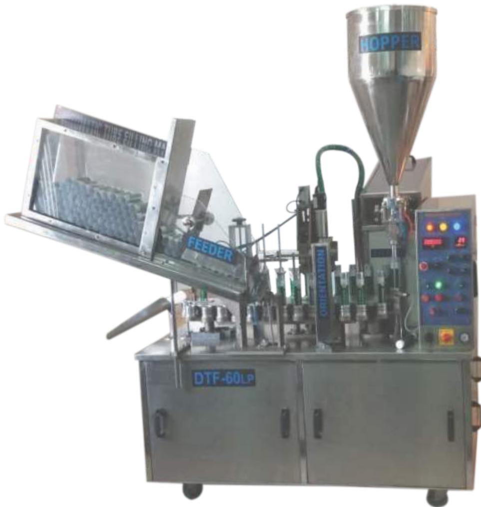
AUTOMATIC LINEAR LAMI TUBE FILLING MACHINE Output : 60 tubes per minute