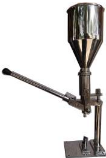
Manual Tube Filling 10ml to 100ml

Output : 35-40 tubes per minute Grammage : 5 gms to 250 grams Tube Dia : 10+40 mm hieght 60-200 mm