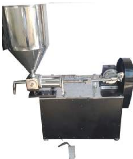
Motorised Tube Filling 50ml to 250ml