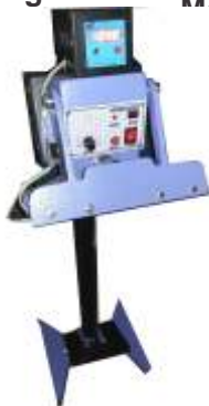
Manual Lami Tube Sealing Machine Peddal type