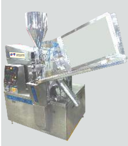
AUTOMATIC ALLUMINIUM TUBE FILLING MACHINE

Output : 50 tubes per minute Grammage : 5 gms to 250 grams Tube Dia : 10+40 mm hieght 60-200 mm