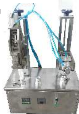
Lamit Tube Sealing Machine Pnuematic