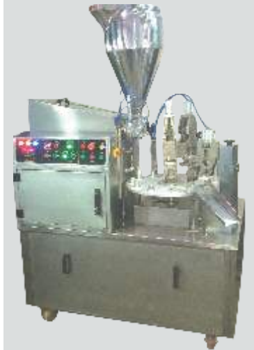
SEMI AUTOMATIC ALLUMINIUM TUBE FILLING MACHINE

Output : tubes per minute Grammage : 5 gms to 250 grams Tube Dia : 10-40 mm hieght 60-200 mm