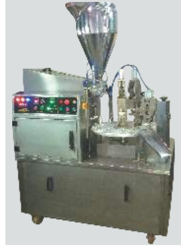
SEMI AUTOMATIC LAMI TUBE FILLING MACHINE

Output : 35-40 tubes per minute Grammage : 5 gms to 250 grams Tube Dia : 10+40 mm hieght 60-200 mm